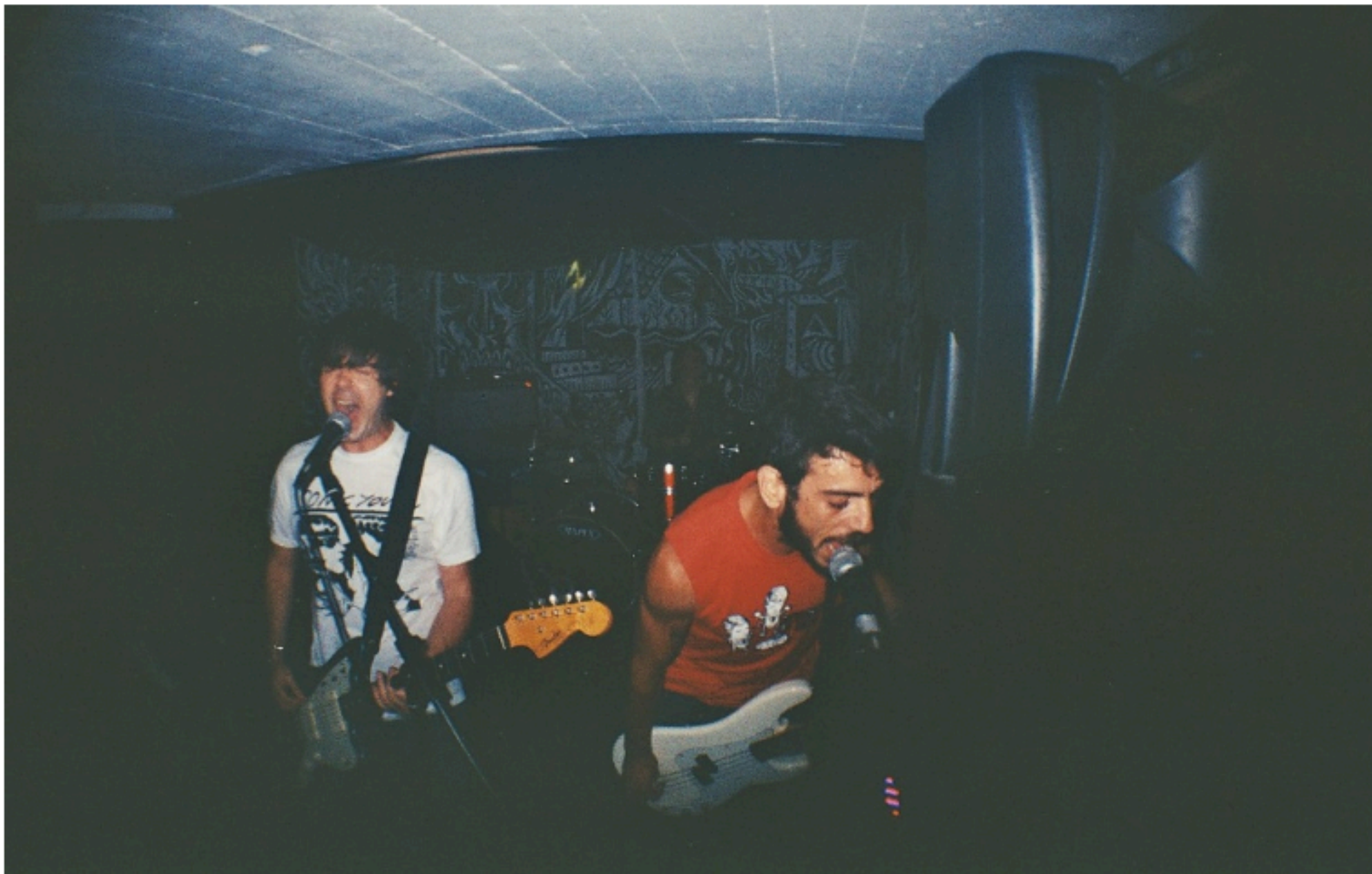
WILD ANIMALS live by Pifia Records (aka Riva)

Any upcoming non-WILD ANIMALS projects you'd like to share?